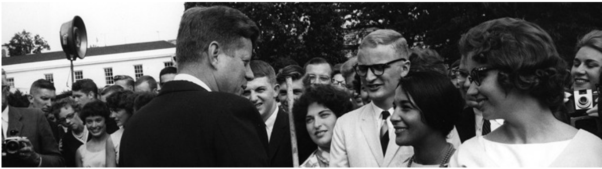
President Kennedy greeting the first Peace Corps Volunteers (from my generation!).